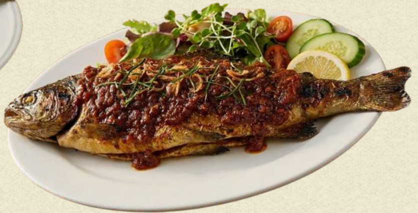
IKAN BAKAR BELACAN 23.95 Grilled trout with homemade spicy belacan sauce