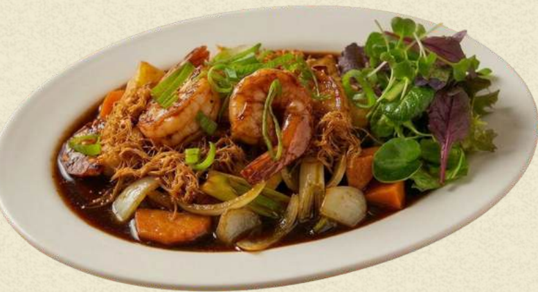
BUTTER PRAWN 18.50