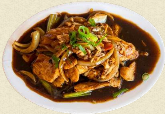
CHICKEN WITH BLACK BEAN SAUCE 19.50