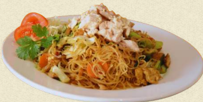
BIHUN GORENG CHICKEN 17.95