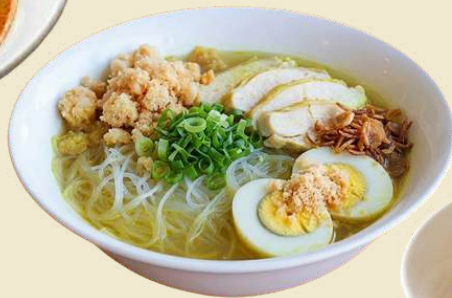
SOUP SOTO AYAM