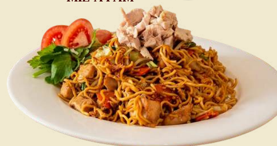
MIE GORENG CHICKEN