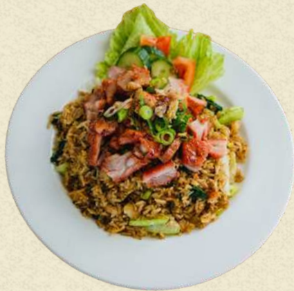
NASI GORENG CHICKEN CHARSUI 19.95