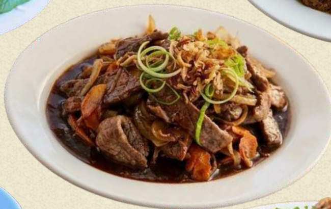
BEEF TERIYAKI 20.50