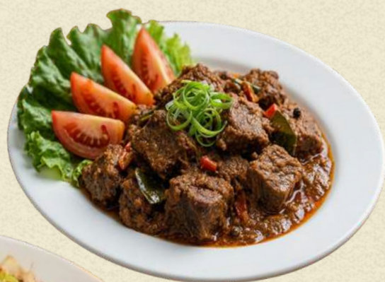
BEEF RENDANG 20.50