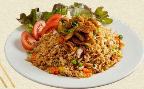
NASI GORENG BABAT 18.95 Tripe, chicken