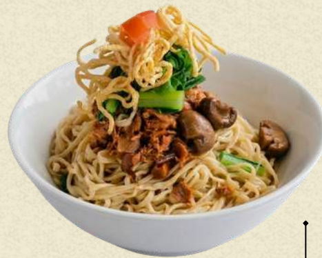
MIE AYAM JAMUR 16.95 Chicken Mushroom