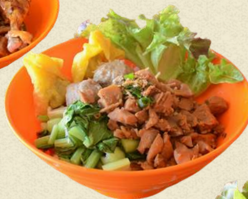
MIE AYAM KOMPLIT 18.95