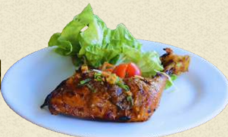
GRILLED/ FRIED CHICKEN ¼ 9.50, ½ 17