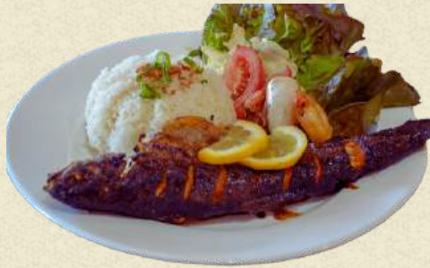
NASI SEAFOOD BAKAR 27