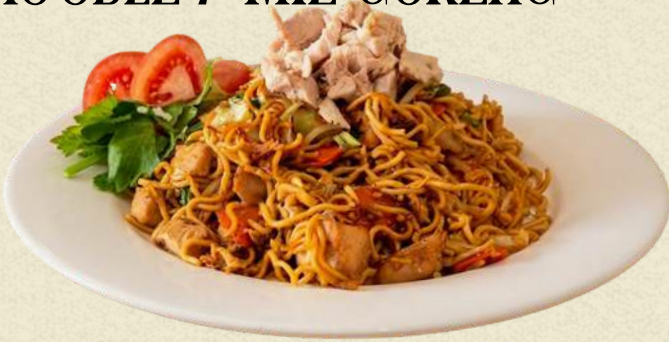
MIE GORENG CHICKEN 17.95