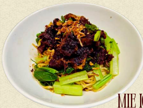
MIE IGA 18.95