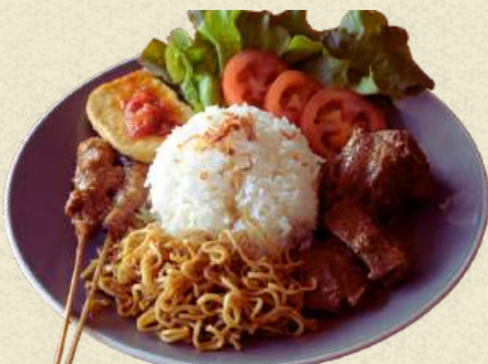
NASI CAMPUR 19.95