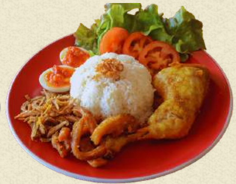
NASI SUNDA 19.95

Beef Rendang, Egg, Chicken Curry, ikan bilis