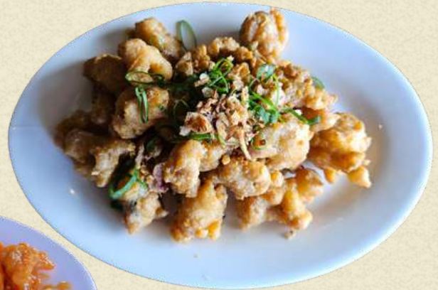
SALTED EGG CHICKEN 18.50