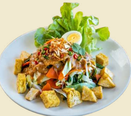
GADO - GADO