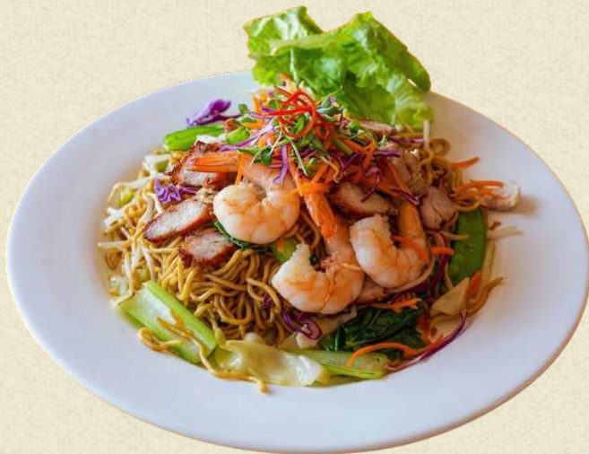
MIE GORENG HONGKONG 18.95