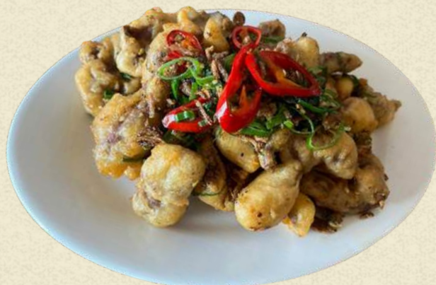
BEEF CHILLI PEPPER 19.50