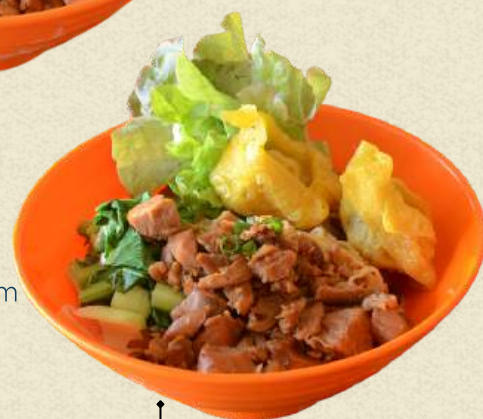
MIE AYAM PANGSIT 17.95