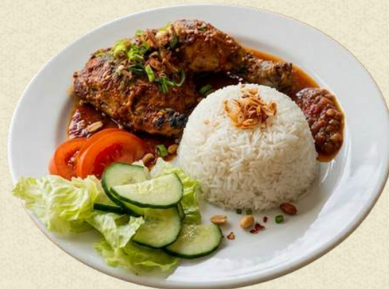
NASI AYAM BAKAR RUJAK 14.95

Chicken, Tofu, Tempe, Vegie, Pecel Sauce