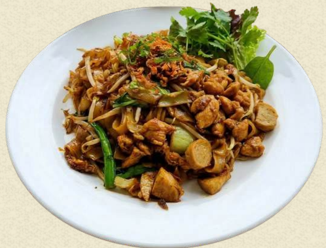
KWETIAW GORENG CHICKEN 17.95