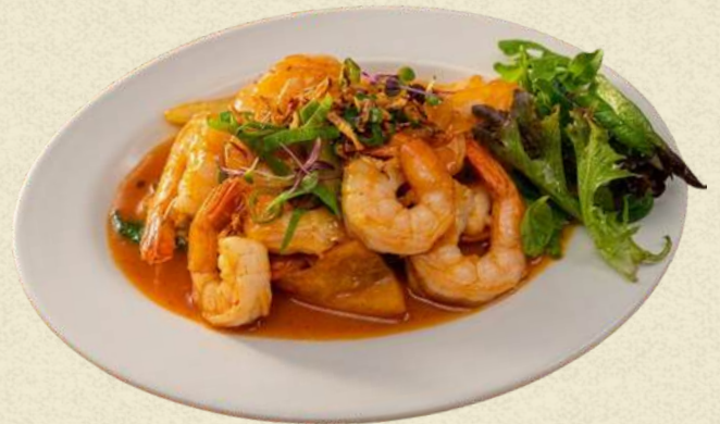
SWEET SOUR PRAWNS 19.50