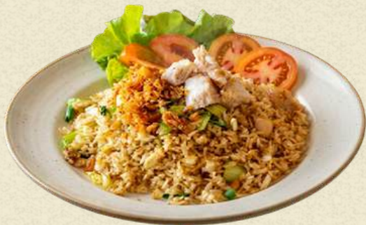
NASI GORENG IKAN ASIN 18.50 Salted Fish, Chicken