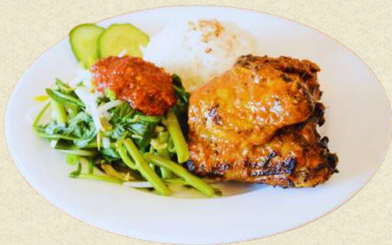
NASI AYAM TALIWANG 18.95