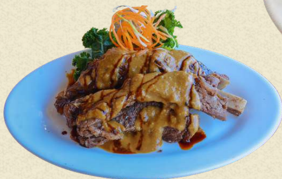
IGA BAKAR KACANG 20.50 Grilled Beef Rib Peanut Sauce