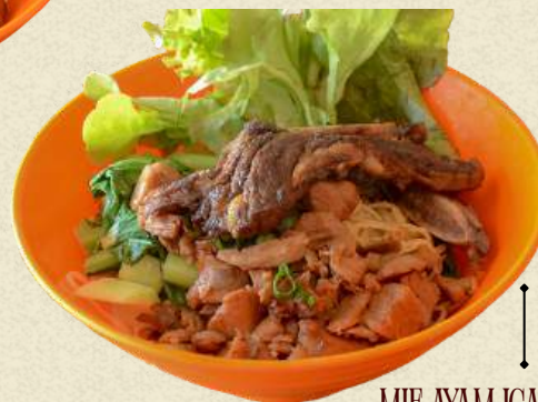
MIE AYAM IGA BAKAR 18.95