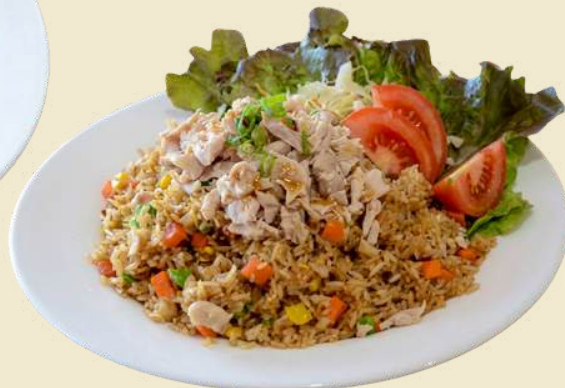
NASI GORENG CHICKEN