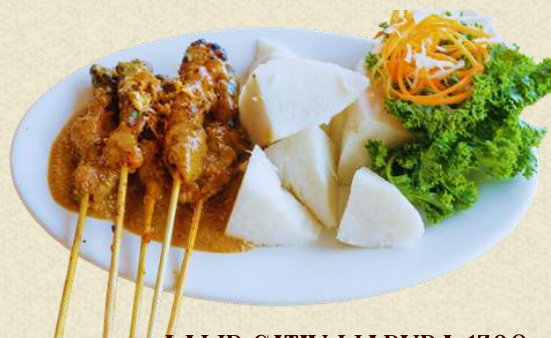
LAMB SATAY MADURA 17.90