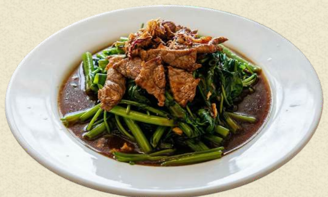
KANGKONG BEEF 21