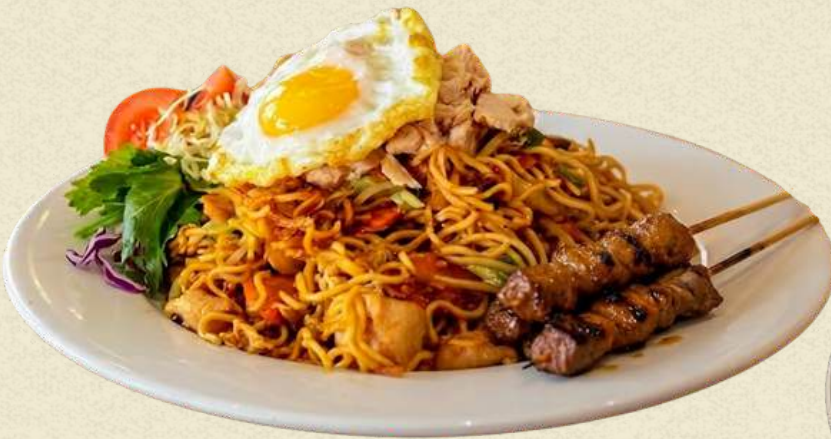
MIE GORENG CHICKEN SPECIAL 20.95