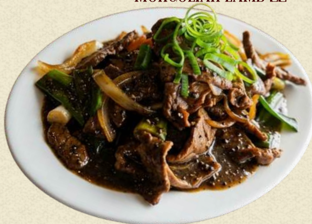
BLACK PEPPER BEEF 20.50