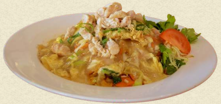
CHAR HOFUN 18.95