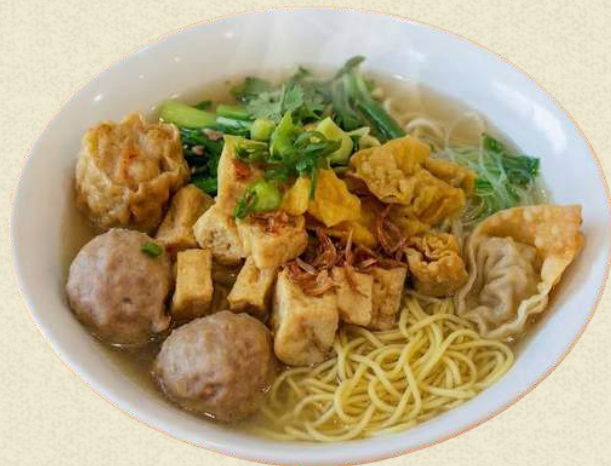
BAKSO CAMPUR 18.95 Noodle, Vegie, Tofu, Wonton, Beef Balls