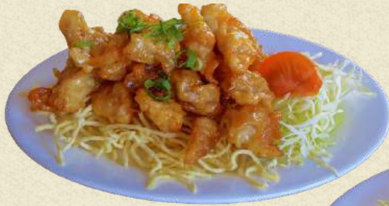
HONEY CHICKEN 16.90