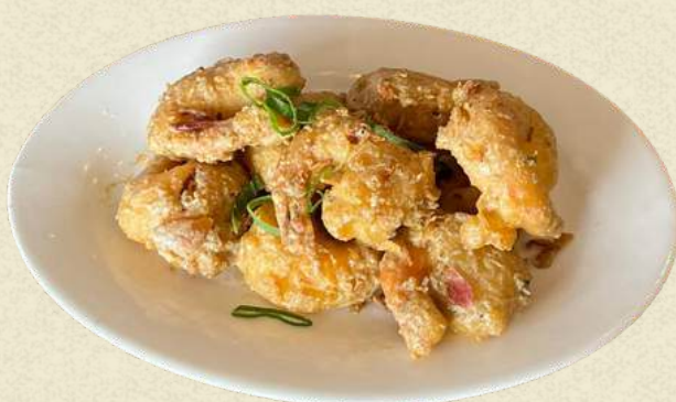
SAITED EGG PRAWN 19.50