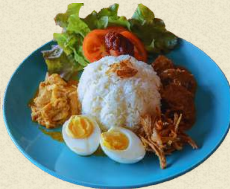
NASI LEMAK KOMPLIT 19.95

Beef Rendang, Egg, Chicken Curry, ikan bilis