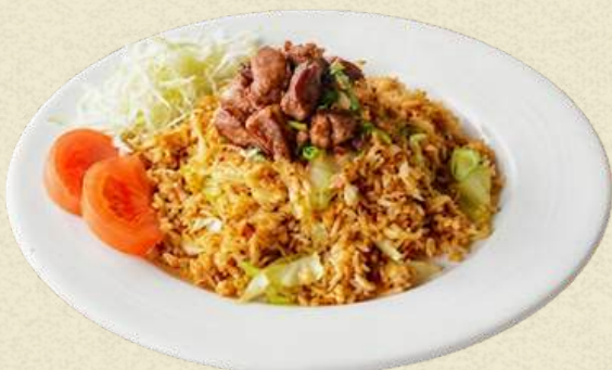
NASI GORENG LAMB 19.95