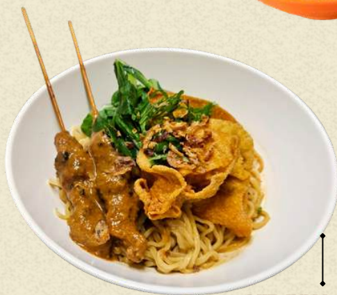
MIE AYAM SATAY WONTON