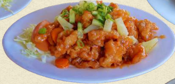
SWEET & SOUR CHICKEN 16.90