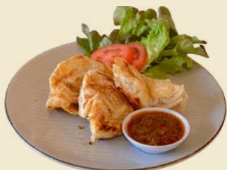
PARATA 3 PCS

Yellow Rice, Beef Rendang, Egg, Ikan Bilis