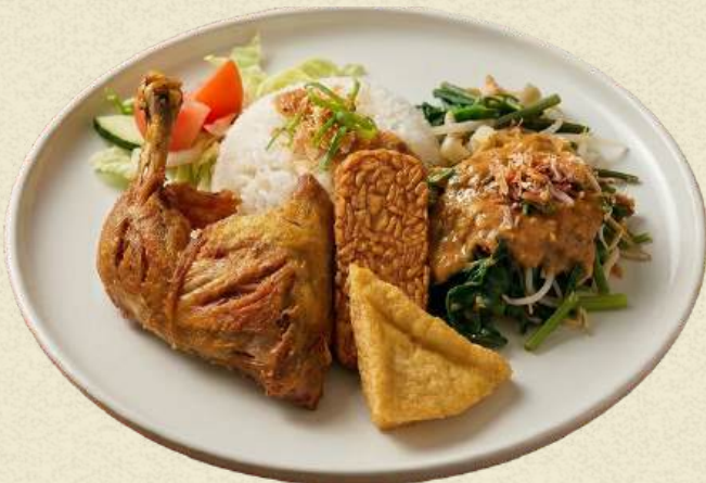
NASI PECEL 21

Chicken, Tofu, Tempe, Vegie, Pecel Sauce