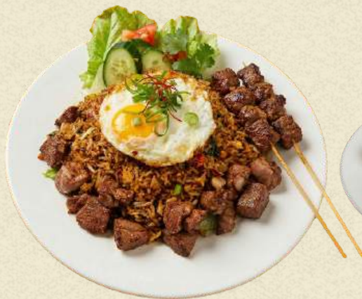
NASI GORENG LAMB SPECIAL 22.90 Satay, Egg, Lamb