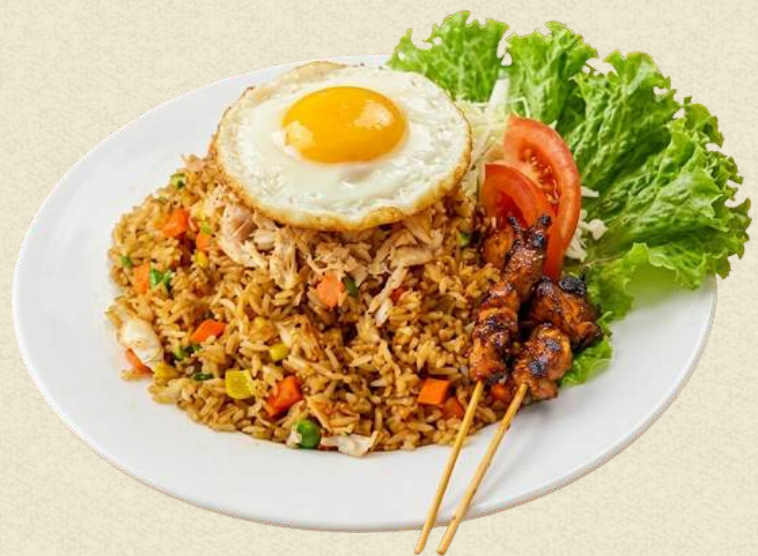
NASI GORENG CHICKEN SPECIAL 20.95 Satay, Egg, Chicken