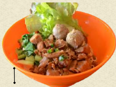
MIE AYAM BAKSO 17.95