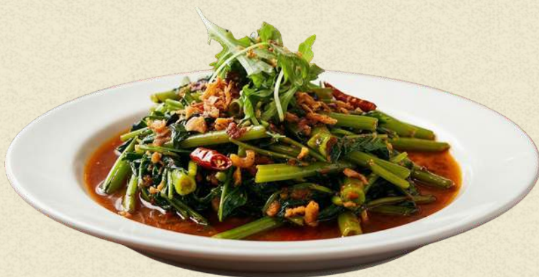
KANGKONG SPICY BELACAN 19