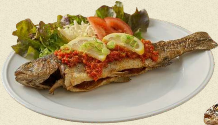
IKAN GORENG RICA 23.95 Deep fried trout rica sauce