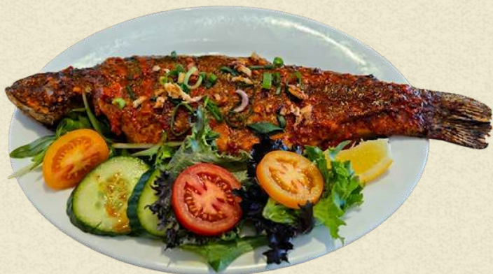
IKAN BAKAR TALIWANG 23.95 Grilled trout spicy taliwang sauce