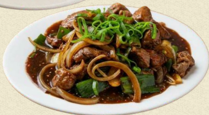
MONGOLIAN LAMB 22