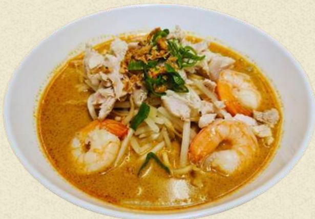
CURRY LAKSA 18.95 Hokkian noodle, Chicken, Prawn, Beansprout