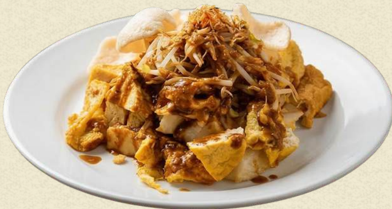
TAHU TELUR KACANG 19.95