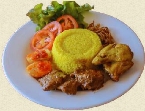
NASI KUNING KOMPLIT 19.95