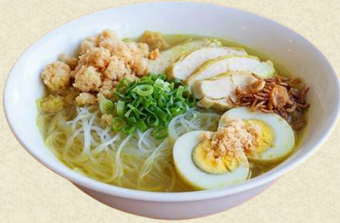
SOTO AYAM 18.95 Glass Noodles, Chicken, Egg, Koya