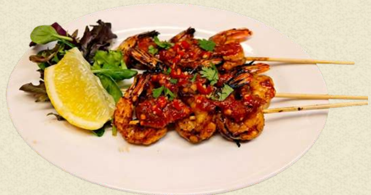
GRILLED PRAWNS CHILLI PENYET 18.50