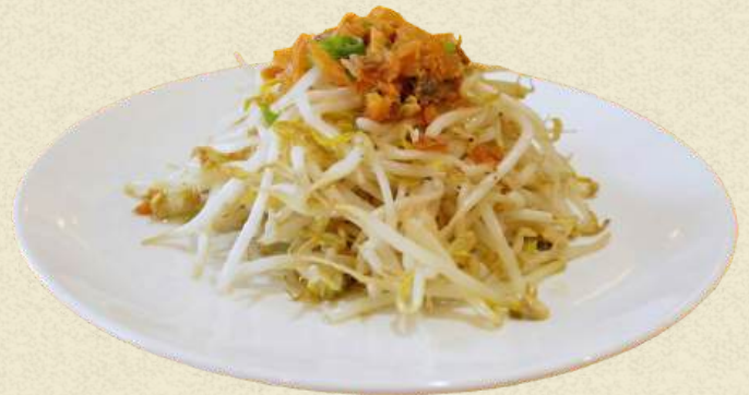
BEANSPROUT SALTED FISH 19.95