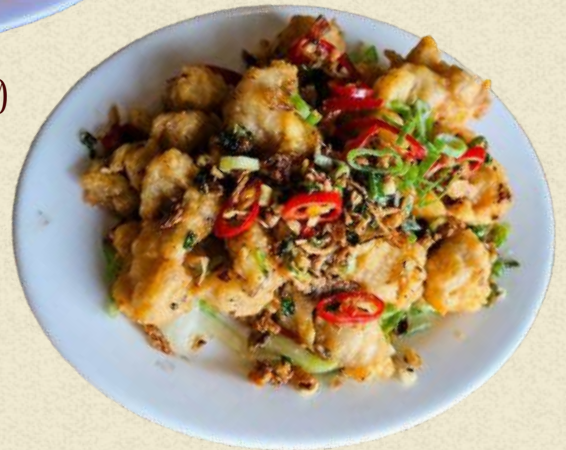
CHILI PEPPER CHICKEN 18.50