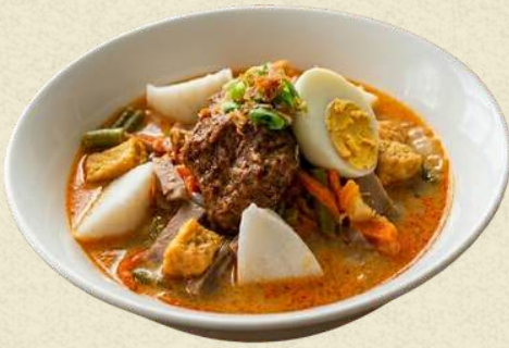
LONTONG SAYUR 18.95 Rice Cake, Mixed Veg, Egg, Beef Curry