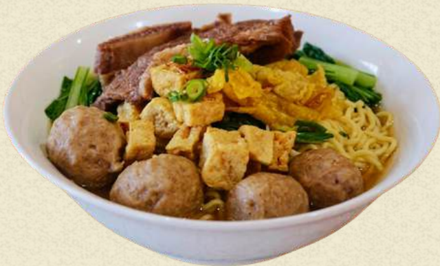
BAKSO CAMPUR IGA 20 Noodle, Rib, Wonton, Tofu, Veg, Beef Balls