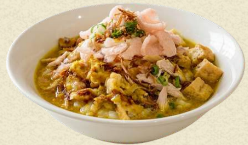
BUBUR AYAM JAKARTA 16.95