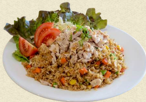
NASI GORENG CHICKEN 17.95 • with beef 19.95