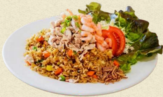
NASI GORENG HONGKONG 19.95 Chicken, Prawn