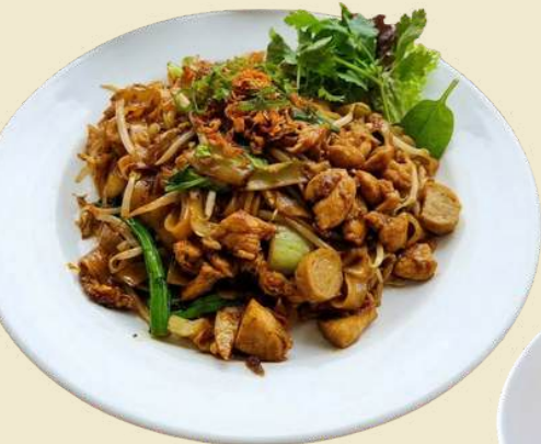
CHICKEN KWETIAU GORENG