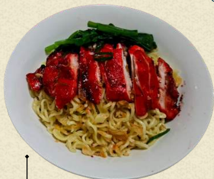
MIE AYAM CHAR SIU 18