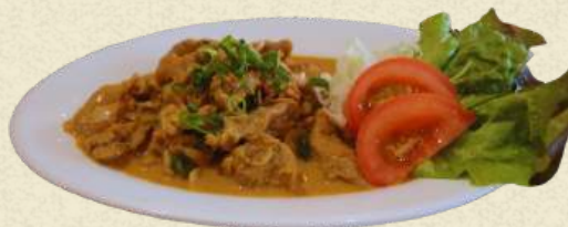
CHICKEN CURRY 18.90