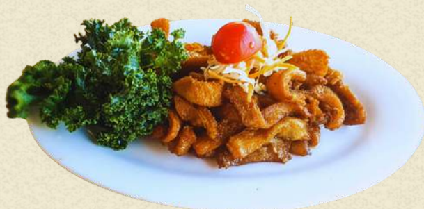
BABAT GORENG / BEEF TRIPE 18.50