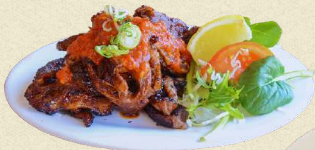
IGA BAKAR PENYET 20.50 Grilled Spicy Beef Rib