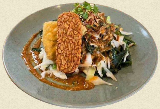
SAYUR PECEL 19

Mixed vegies, Tofu, Egg, Potato, Peanut Sauce